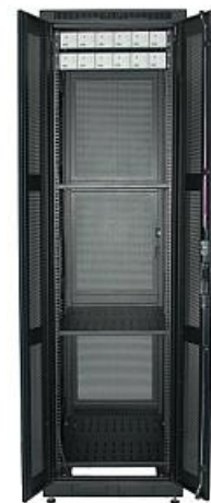
By-Folded Rear Door (both door open)