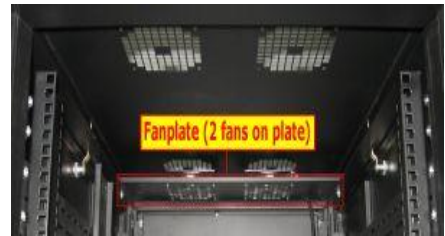
Fanplate (2 fans on plate)