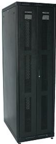
By-Folded Rear Door