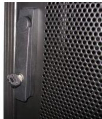
Lockable Perforated Door