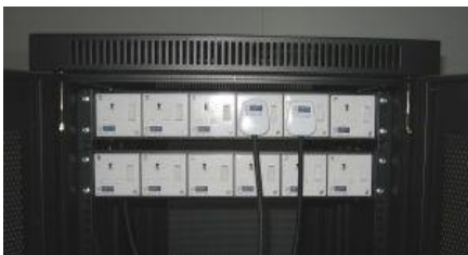
6 Way Horizontal Power Strip x 2 unit