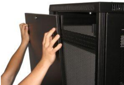
Removable side panel