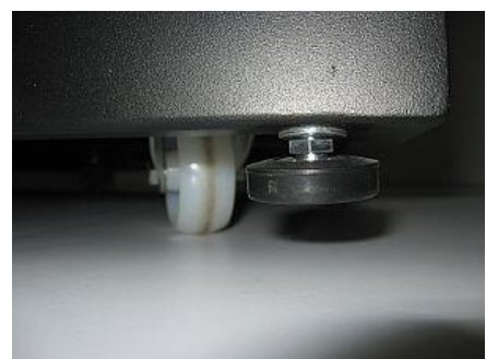
Castor Wheels and Leveling Feet