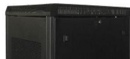
Full slotted Top Frame