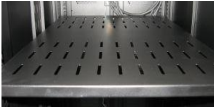
Equipment Shelf (vented)