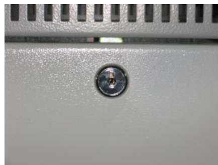
Cam Lock on Side Panels