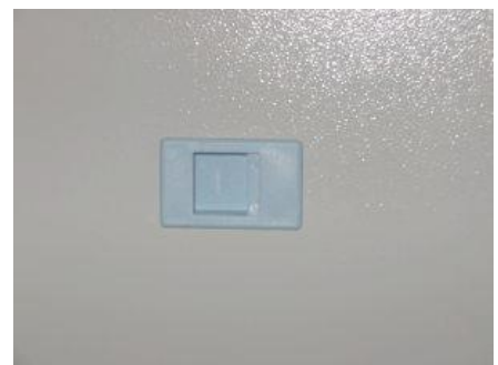
Quick-Release side latch on Side Panels