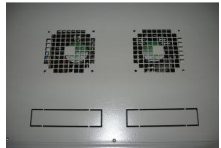
Top Cable Entry Access