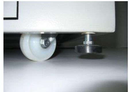
Castor Wheels and Leveling Feet