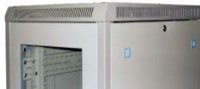
Full slotted Top Frame