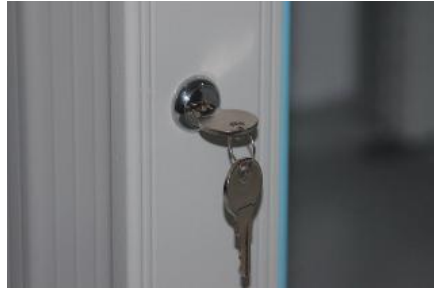
Cam Lock (on Front Glass Door)