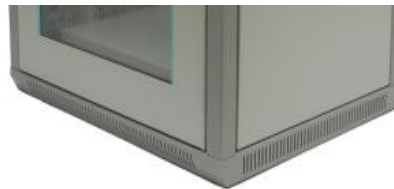
Full Slotted Frame (Bottom)