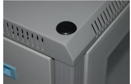
Protective Bumpers (Close-up)