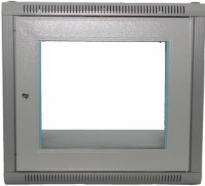
Lockable Front Glass Door