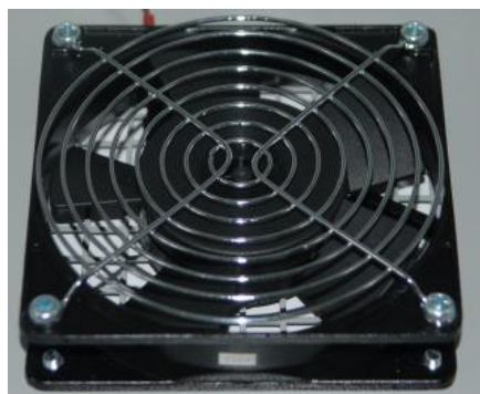
Full Slotted Frame (Top)