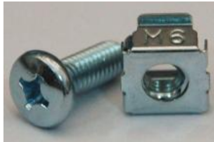
Cage nuts & Screws