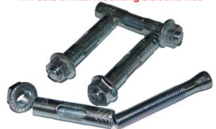
Wall Mounting Bolt and Nuts