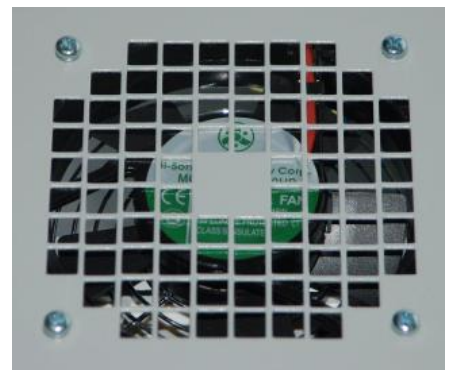
Full Slotted Frame (Bottom)