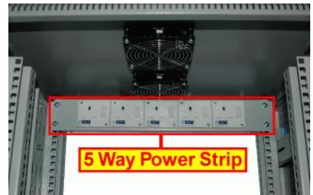
5 Way Power Strip