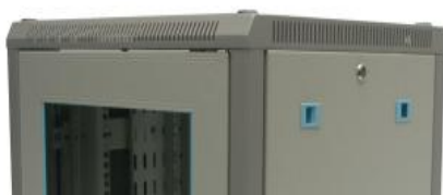
Full Slotted Frame (Top)