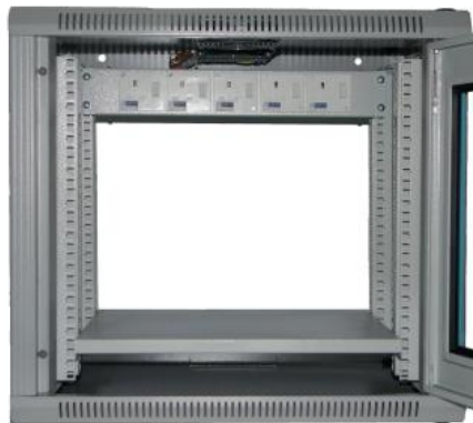
Internal Front View