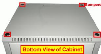
Protective Bumpers (Bottom)