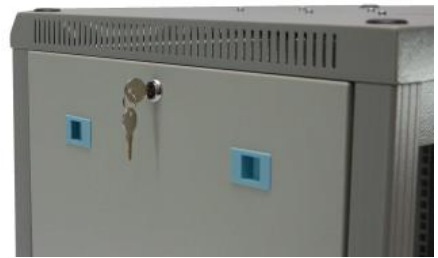
Cam Lock (on Side Panels)