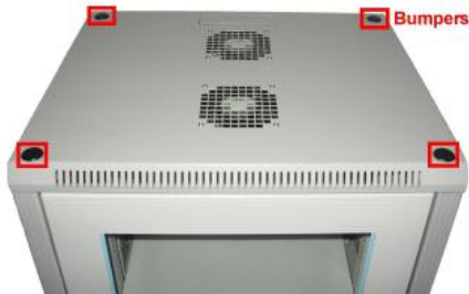
Protective Bumpers (Top)