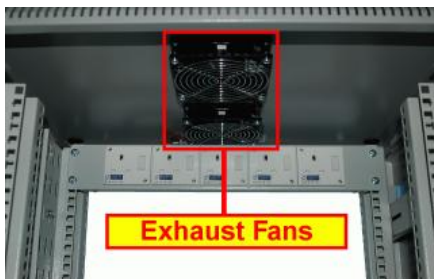
Top Exhaust Fan